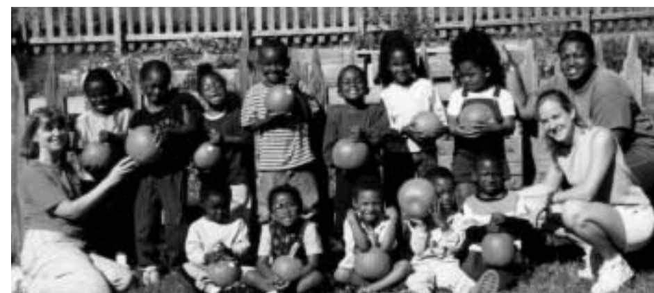
A great beginning for lifelong learning.

During this half day, structured, developmentally appropriate early education program, the children are fed a nutritionally balanced breakfast and lunch and are introduced to literature, art, music, and math and science concepts each day. They also learn conflict resolution skills, responsibility, independ-