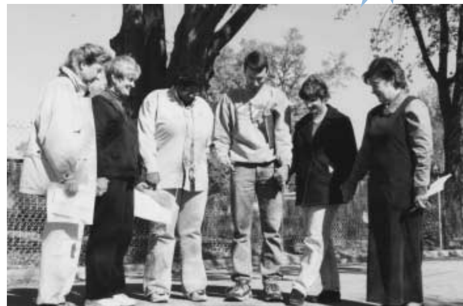
Praying on location for our new neighbors.

Next I read Mark 10:13-16 and prayed, “Lord, I ask that You bless the children